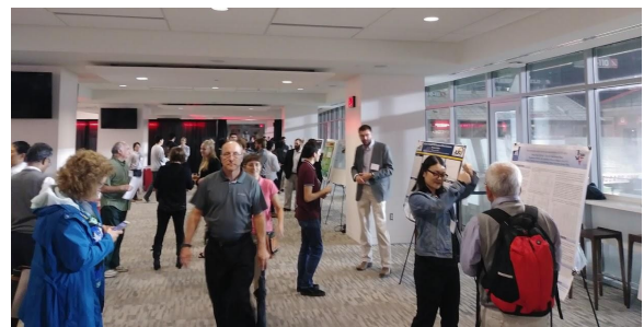
Poster presentations at the Fall 2018 Meeting at the University of Houston. Awards were given for outstanding poster presentations at both the graduate and undergraduate levels.

If you would like to help judge the student presentations , please sign up here .