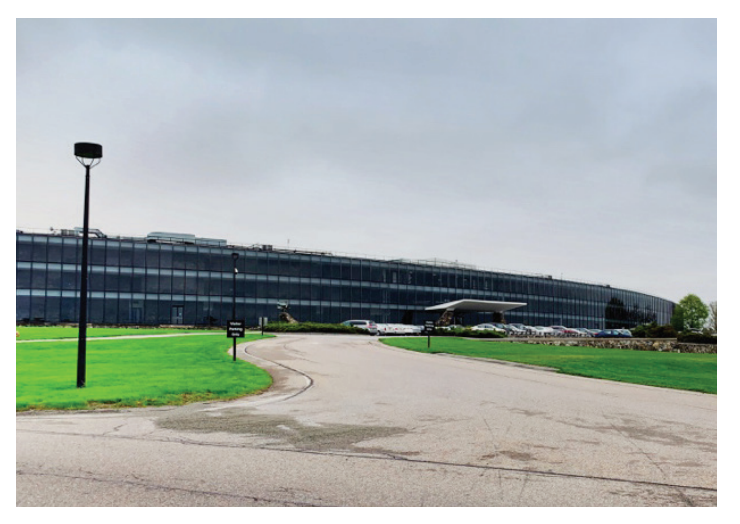
The spring 2019 Topical NY State Symposium at was held at IBM Yorktown Heights.