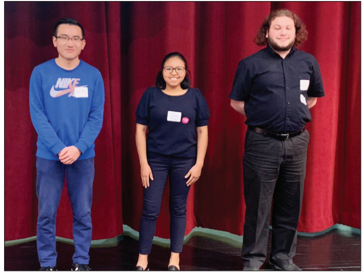
Best Poster Presenters from Corning Symposium