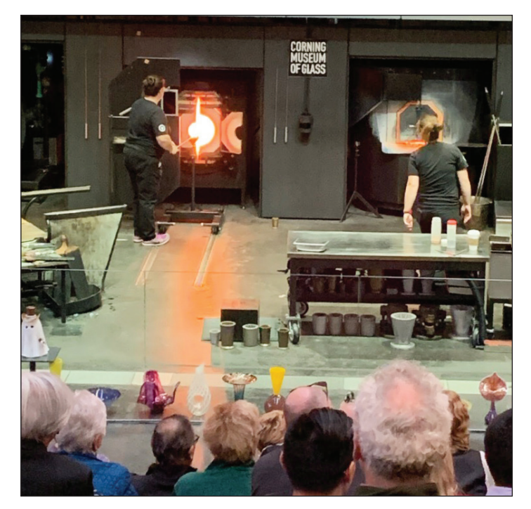
Glass Demonstration at the Corning Museum of Glass