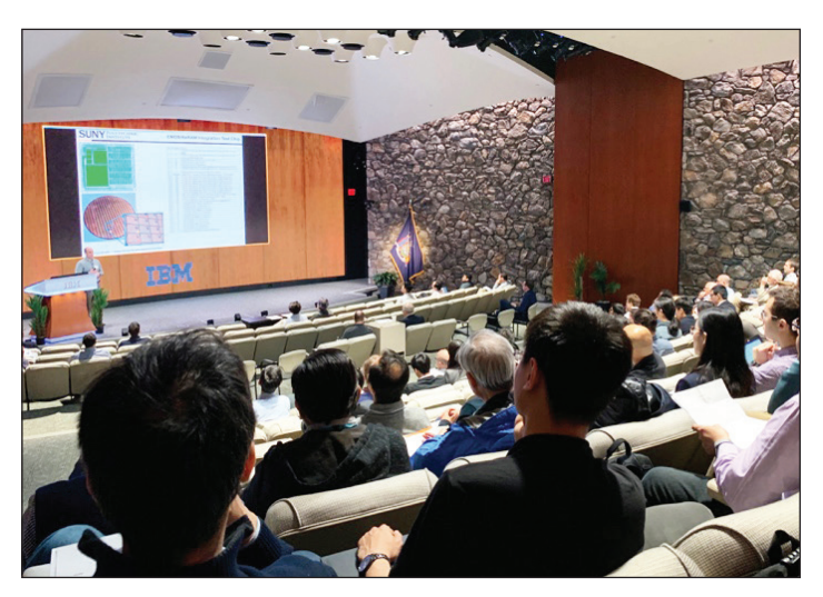
A view from the audience during one of the talks during the symposium.