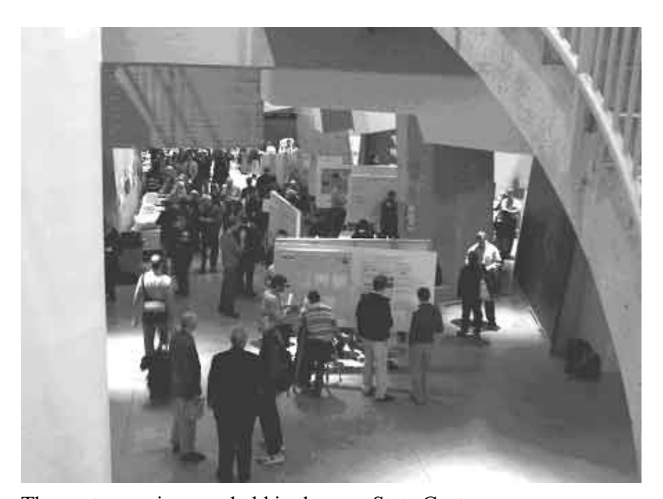
The poster session was held in the new Stata Center

With a two-ion balance, Einstein's famous equation relating mass to energy has been verified to a part in 10,000,000.