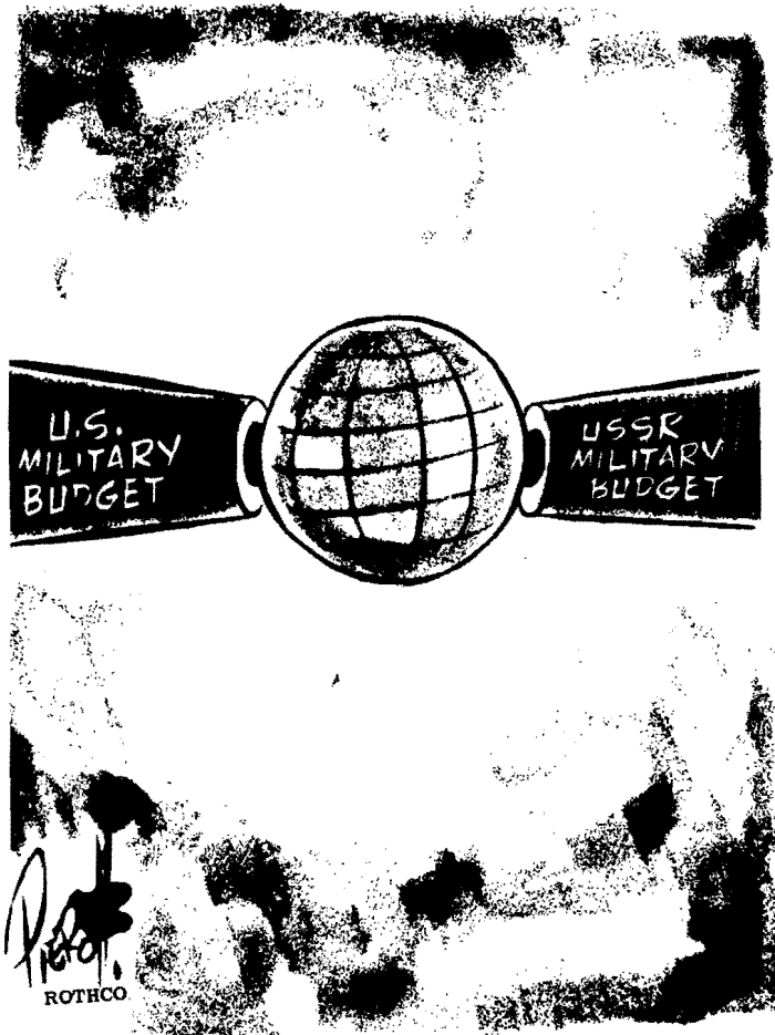
"All rights reserved, may be reprinted only with permission."