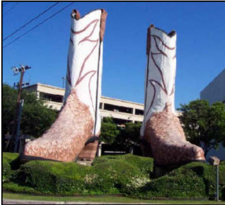
Gigantic boots located at the entrance of North Shore Mall in San Antonio, TX.