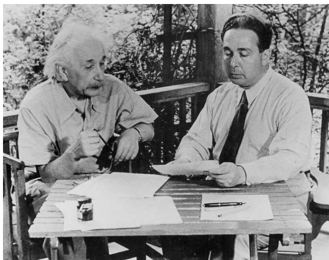
Albert Einstein and Szilard recreate drafting the famous 1939 letter

doubts about negative gene control had been removed.” An intellectual bumblebee indeed!