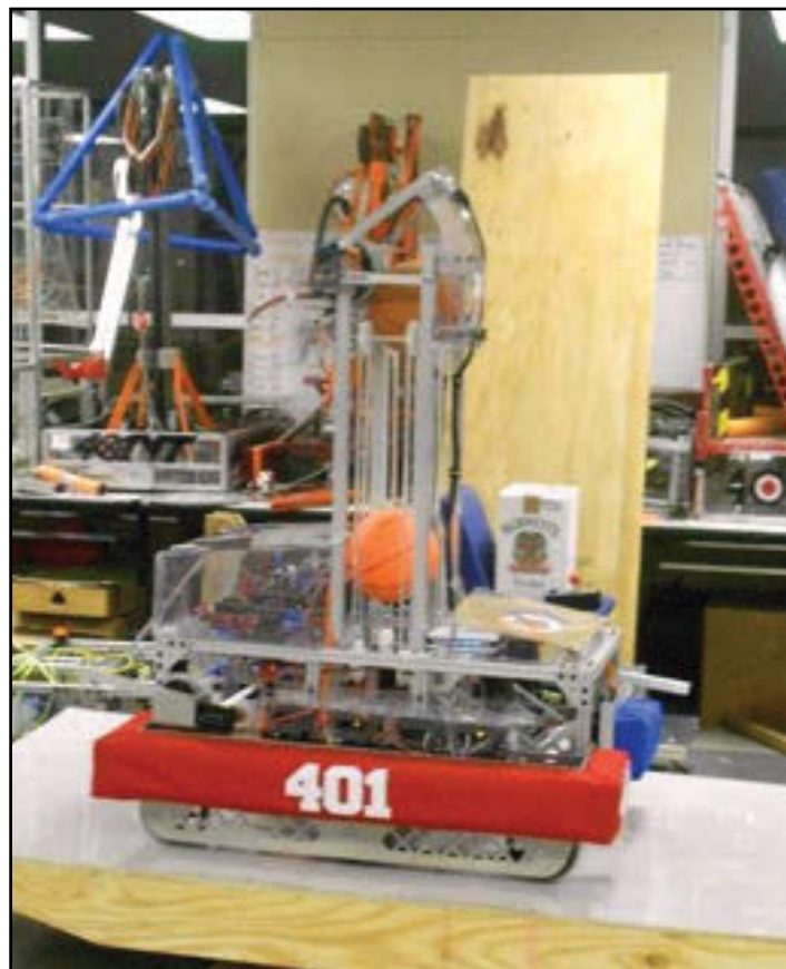
A competition robot made by local high school students with the help of college student mentors.

Perhaps surprisingly, at least some of the answers to these questions come from the presence of a large and successful College of Engineering (COE) at Virginia Tech. Undergraduate COE students account for about 30% of the undergraduate student body at VT. All General Engineering students — students entering the COE — must take two semesters of introductory physics starting in the spring of their freshman year. In the Spring 2015 semester, the Physics Department taught over 1800 engineering students, in