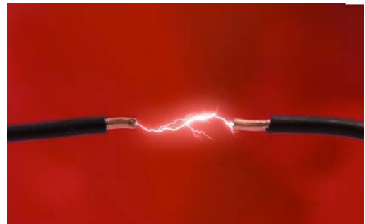
Arcing between electrodes.

While this model seems to be internally consistent, researchers want to use it to produce predictions that can be verified experimentally. Current research is using molecular dynamics to show what happens at the atomic level when the material is torn apart, plasma modeling codes to