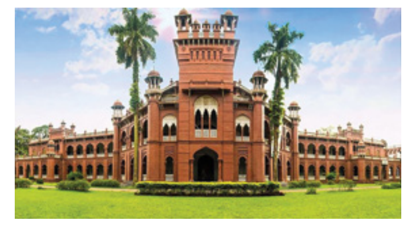
University of Dhaka

and biomedical applications and presented results on the successful creation of various nanofibers and nanostructures in his lab without the use of lithographic techniques. Among the Bangladeshi speakers, two presented new findings that have not been observed before: