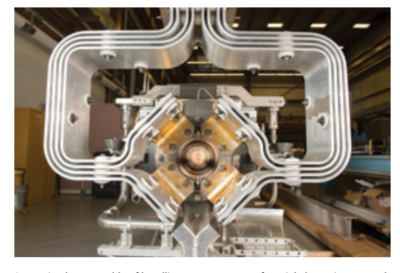
A neutrino horn capable of handling one megawatt of particle beam is prepared at Fermilab in advance of the Deep Underground Neutrino Experiment. Neutrino physics is one of many areas of interest to members of DPF.

The intensity frontier involves the use of accelerators to study more rare and subtle phenomena, in particular, neutrinos—electrically neutral particles that are among the most abundant particles in the universe, yet very difficult to detect