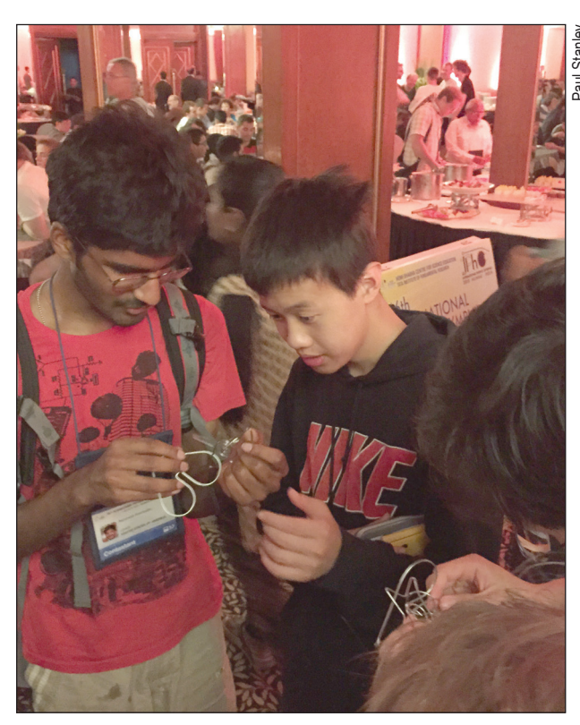
2015 Physics Olympiad Participants

Host countries are expected to draw from the entire syllabus, and often select problems of relevance to the host nation. In Vietnam, a problem was devoted to the physics of a rice pounder; in Denmark, one was devoted to Greenland. Sometimes the problems are farfetched, such as the problem from Singapore: What would be seen by a pinhole camera observing an object that is moving at relativistic speeds? Preparing the experimental portion of the IPhO is probably the most difficult, requiring some 400 pieces of reliable and accurate experimental apparatus. Moreover, unforeseen problems with room lighting, room temperature, or floor vibrations do sometimes arise. Some exams have had some particularly interesting experiments. In Mexico competitors assembled an optics table using cabinetry parts in order to measure the wavelength of light with a millimeter scale, taking advantage of the fringes produced when circularly diffracted light interferes with light diffracted off of a single straightedge. Korea developed a mechanical spring system that was enclosed in a tube. Competitors determined the spring constants of the springs and