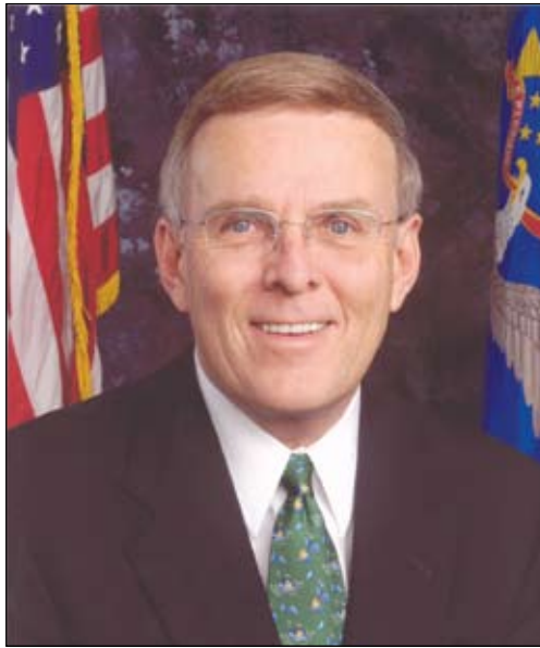
Senator Byron Dorgan (D-ND)

For the past three decades, we Americans have debated the growing threat to our nation's energy security and what to do about it. Each year we hear the warnings. Each year we hear the same solutions suggested. Each year we hear the same objections. It's as if the debate has been on an endless loop.